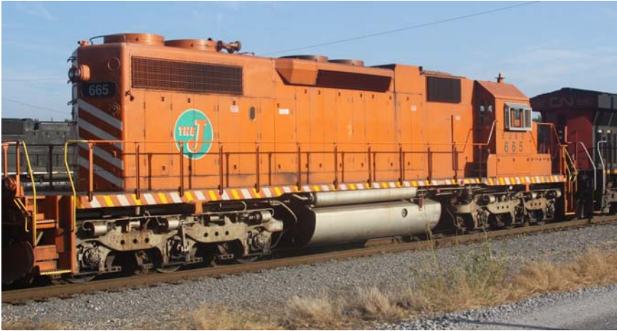
Left, below, and below left: EJ&E pumpkin, left-over war bonnets, and BNSF units move into Fulton, just acquired by CN.